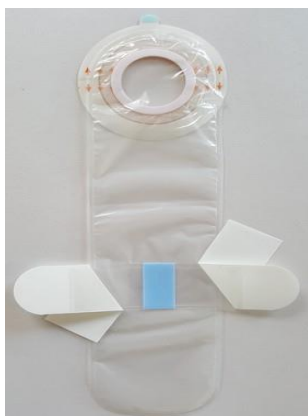
Fig 1. cathdry.com

A patient satisfaction survey was completed since the Cath Dry™ shower and swim dressing was introduced to the Mater Dialysis Unit in 2019. 21 patients were invited to complete the survey, 20 patients responded.