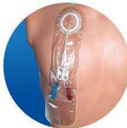
Fig 2. cathdry.direct